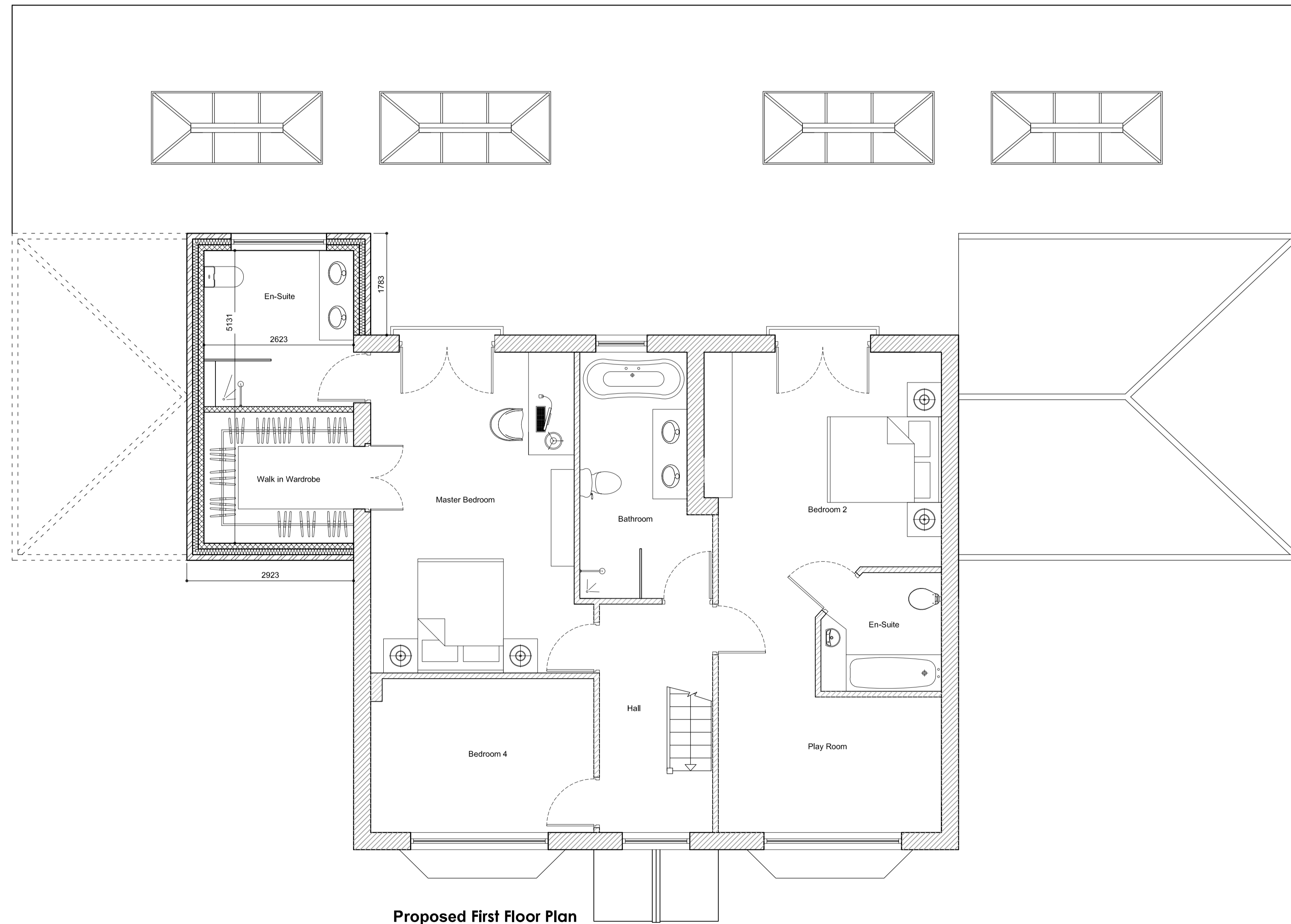
Proposed First Floor Plan 1:50

DRAFT TO BE APPROVED (Please note no works to be undertaken on the project until building control approval has been obtained. Any works undertaken are at your own risk.)